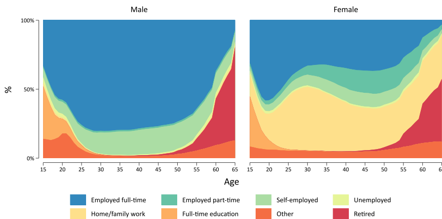
Work situation by age for men and women from age 15 to age 65

Harmonized Life History Data provide annual information from age 15 to age 80 in the following five domains: